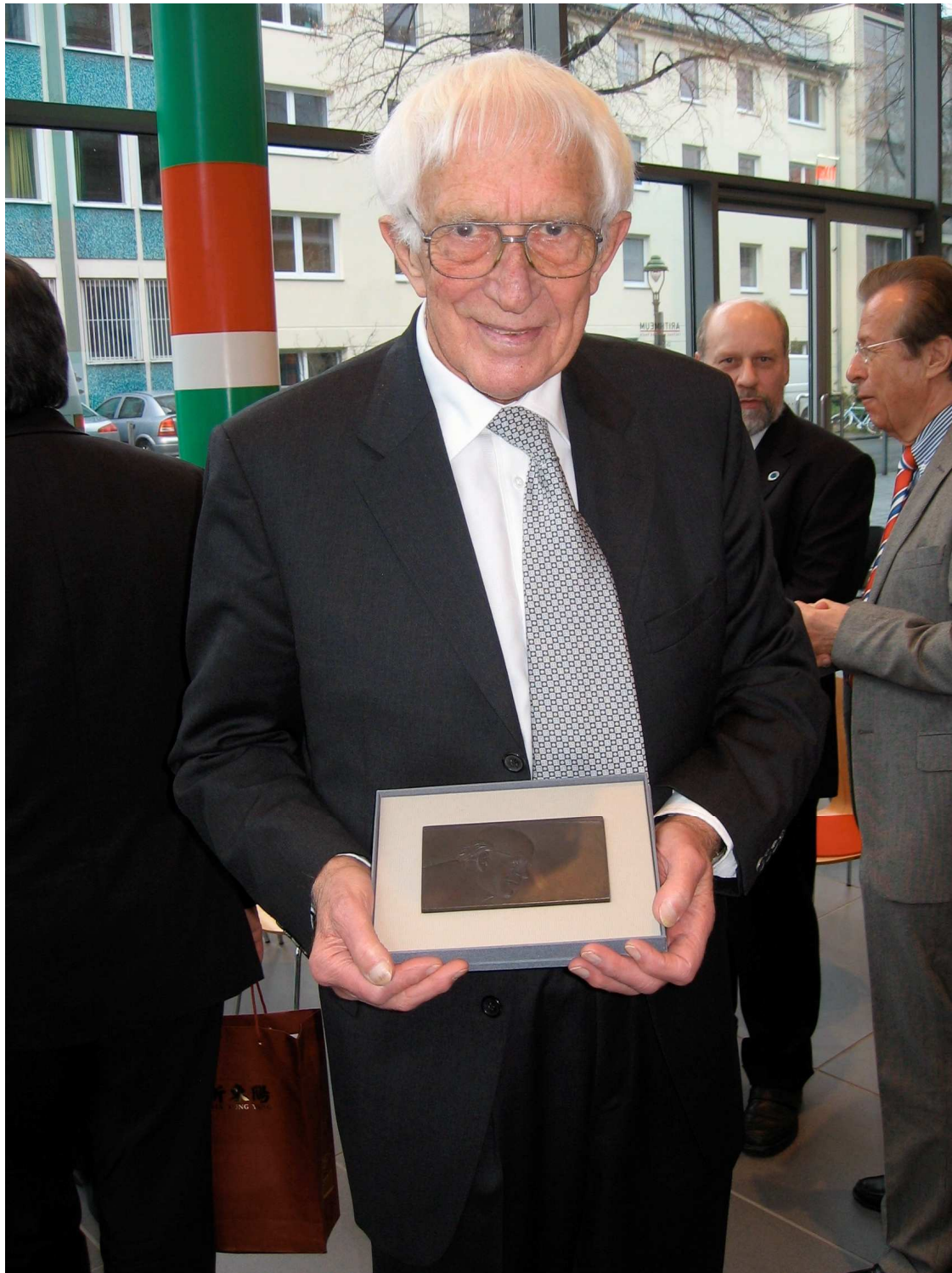
The medal ceremony and associated reception took place in Bonn on December 2 nd 2008. The ceremony and reception made a big impression on me. It will remain a fond and lasting memory for many years to come.